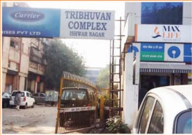
View Form Main Entrance