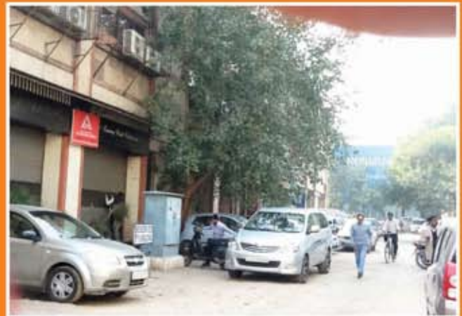
View Towards Neighbour